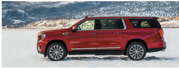
↑ GMC Yukon XL