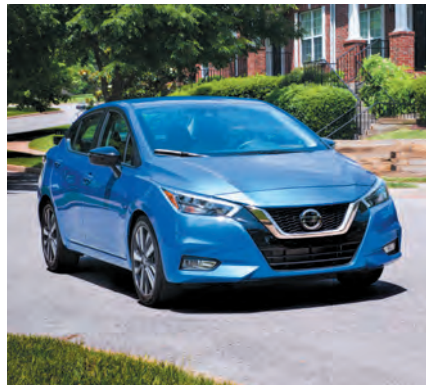
↑ Nissan Versa