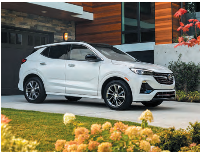
↑ Buick Encore GX

1 Only four-wheel-drive vehicles with a two-speed transfer case that has a Neutral and a four-wheel-drive low setting can be flat towed. Disconnect the negative battery cable at the battery and secure the nut and bolt. Cover the negative battery post with nonconductive material to prevent contact with the negative battery terminal. Use of a shield mounted in front of the vehicle grille could restrict airflow and damage the transmission.