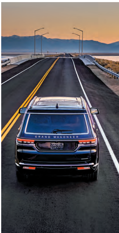
↑ Jeep Grand Wagoneer