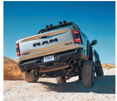
↑ Ram 1500 TRX