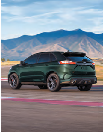
↑ Ford Edge