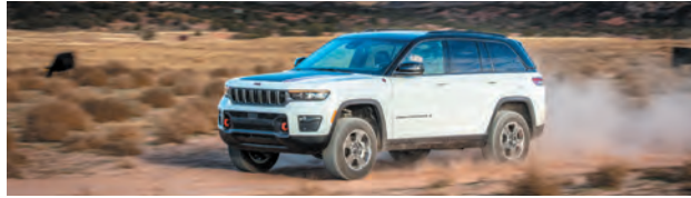
← Jeep Grand Cherokee