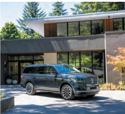
↑ Lincoln Navigator

1 For recreational towing, transfer case must be shifted into Neutral; transmission must be shifted into Park; must be towed in the forward direction.