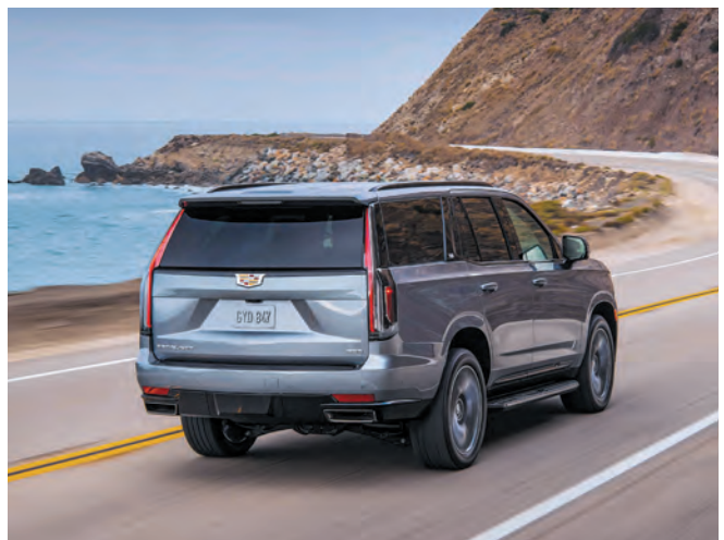
↑ Cadillac Escalade